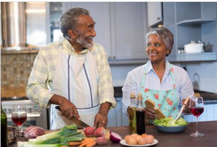
Plan, prep, cook, enjoy ( /more/senior-living/plan-prep-cook-enjoy-243072/ )