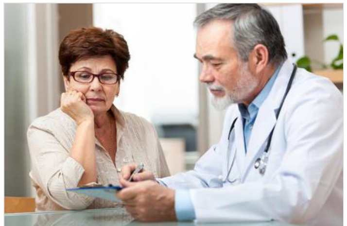
Many Atlantic Canadians behind on their vaccines