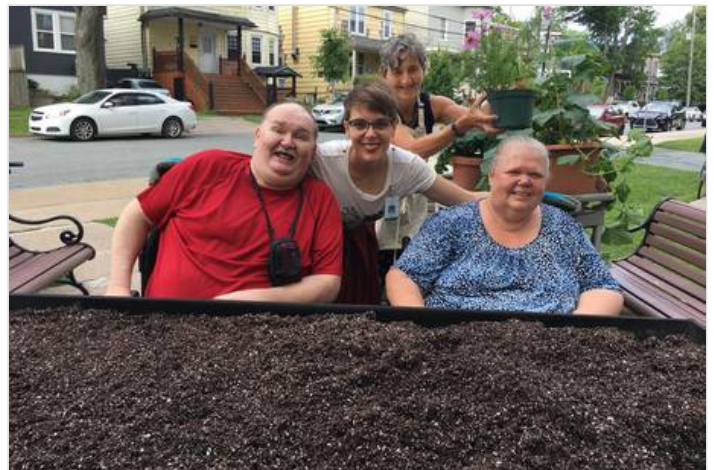
Planting Seeds of Success ( /more/senior-living/planting-seeds-of-success-243105/ )