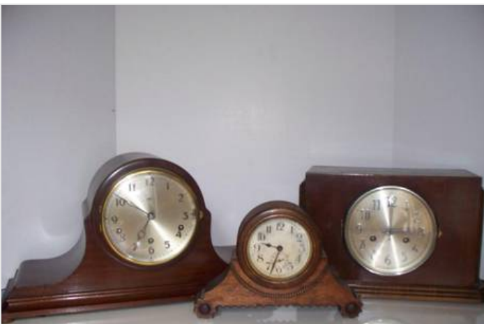
Tick-tock, time to learn about clocks